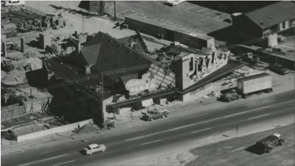
aerial view looking north from late 1950's; arrow pointing to site:

In 1956 Tahoe Colonial Club became Tahoe Palace. In 1959 it was renamed Tahoe Plaza. pic from late 1950's during renovation of the property; the roof of the original structure can be seen behind the new facade.: